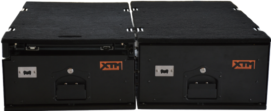
4WD Single drawer with slide (PLU 553735)