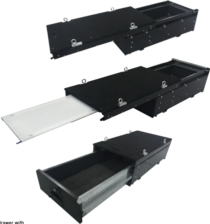
4WD Single drawer with slide (PLU 553735)