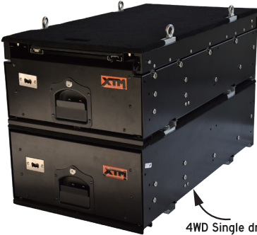
4WD Single drawer (PLU 584030)